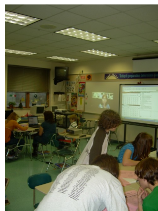
The Hurricane, Volcano, Evacuation, and Communication teams work to save the residents of Montserrat.

Skype is already installed on CFF teacher laptops; you simply need to create an account. Year 2 teacher laptops have an integrated webcam and Year 1 teachers can access the available portable webcams.